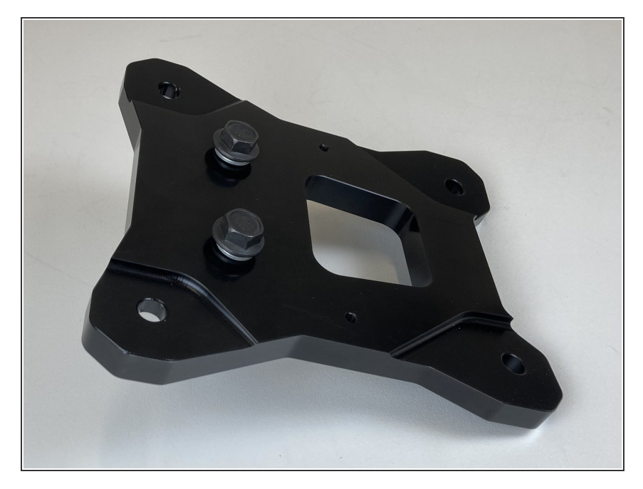
IMAGE 1 Assemble the new gusset plate by using the supplied bolts and lock washers along with an 18mm socket or wrench. Ensure lock washers are completely compressed.